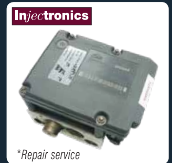
ABSJAGMK20REP ABS Module