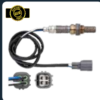
OX478GEN Oxygen Sensor

Lexus ES300 / Subaru Legacy, Liberty, Outback, Tribeca / Toyota Landcruiser