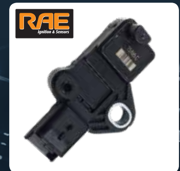
SC581 Crank Sensor

Citroen C4, C5 / Ford Focus LT, LV / Mondeo MA, MB, MC, Peugeot, Volvo