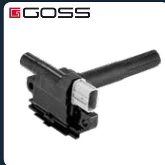
GIC681 Ignition coil