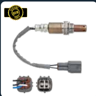
OX439GEN Oxygen Sensor

Lexus ES300 / Subaru Legacy, Liberty, Outback, Tribeca / Toyota Landcruiser