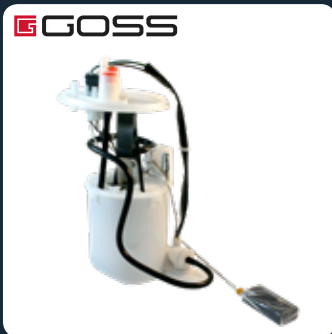
GE492 Fuel pump module